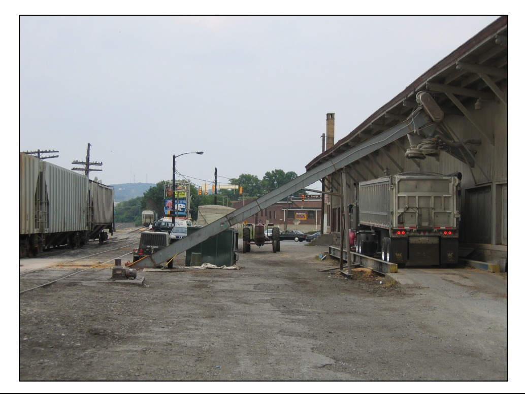
Photo 5: View of Agmark transloading facility between N. Beaver St, and N. George St.