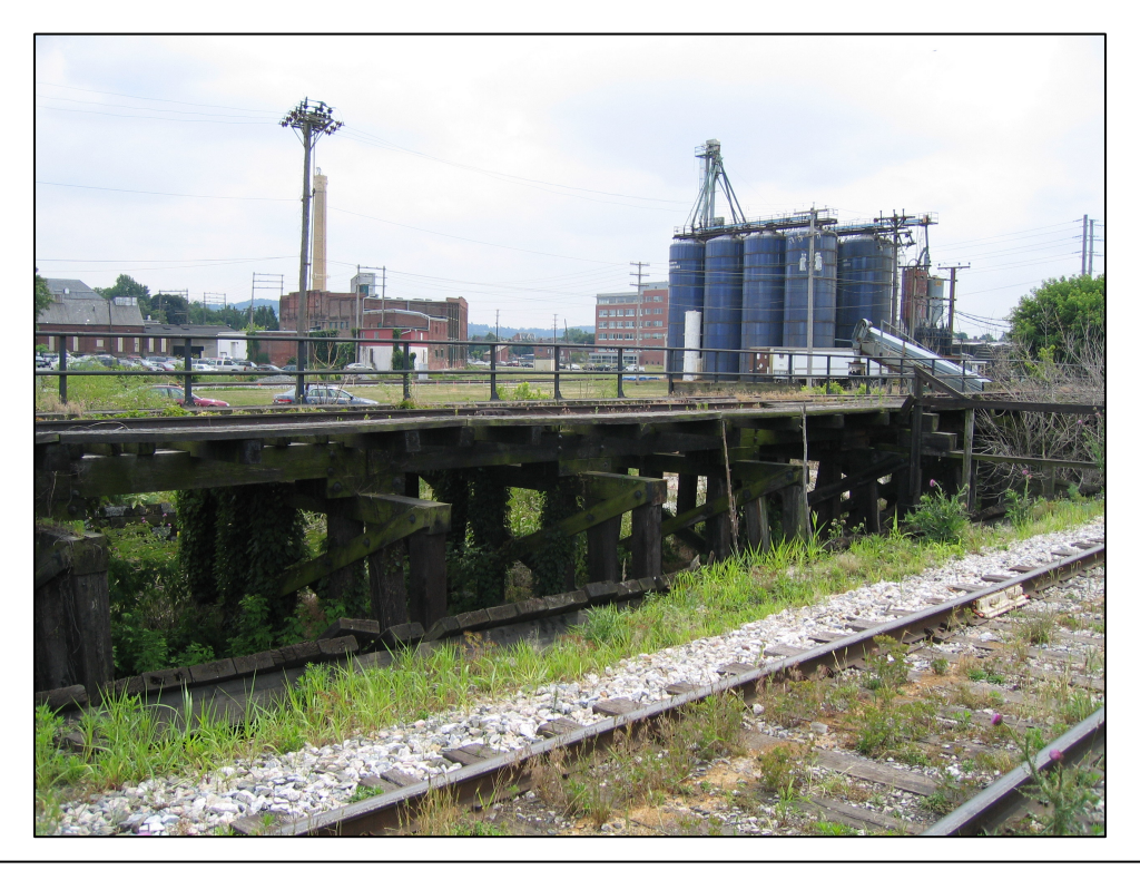
Photo 6: View of abandoned timber trestle between mainline and West Branch.

Photo 5: View of Agmark transloading facility between N. Beaver St, and N. George St.