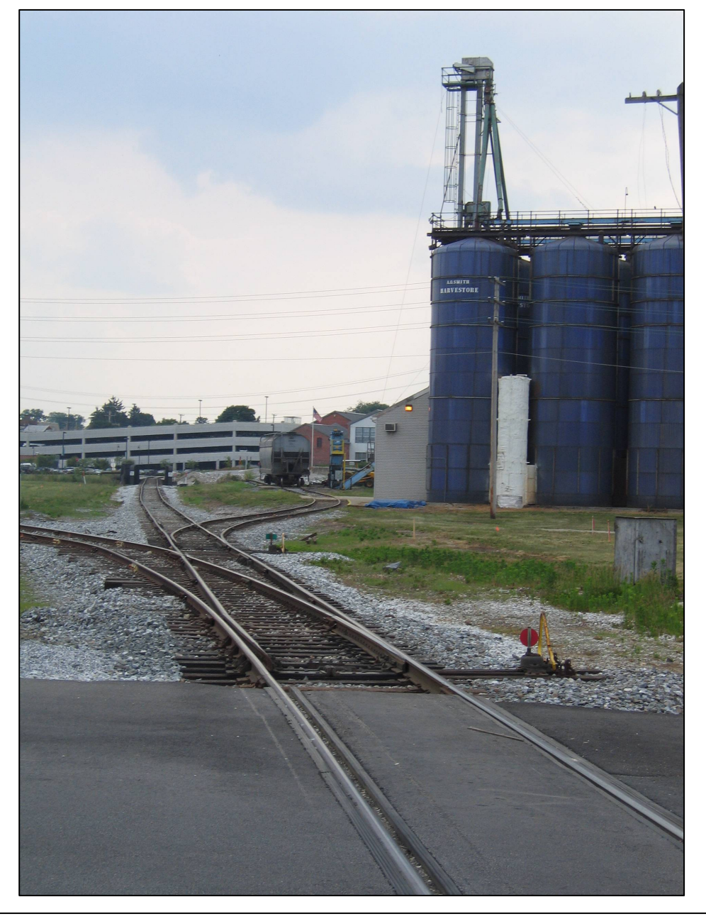
Photo 4: View of track (two turnouts) and Ohio Blender site from gradecrossing at North Beaver Street. Bridge No. 13.53 (TPG) in background.