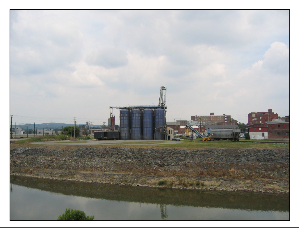
Photo 1: View the Ohio Blender facility across Codorus Creek. Note bank of the creek and covered hopper.