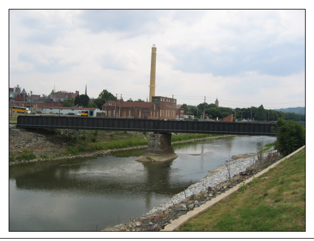
Photo 2: Elevation view of Bridge 13.62 (TPG) looking upstream from north bank of Codorus Creek.

Photo 1: View the Ohio Blender facility across Codorus Creek. Note bank of the creek and covered hopper.