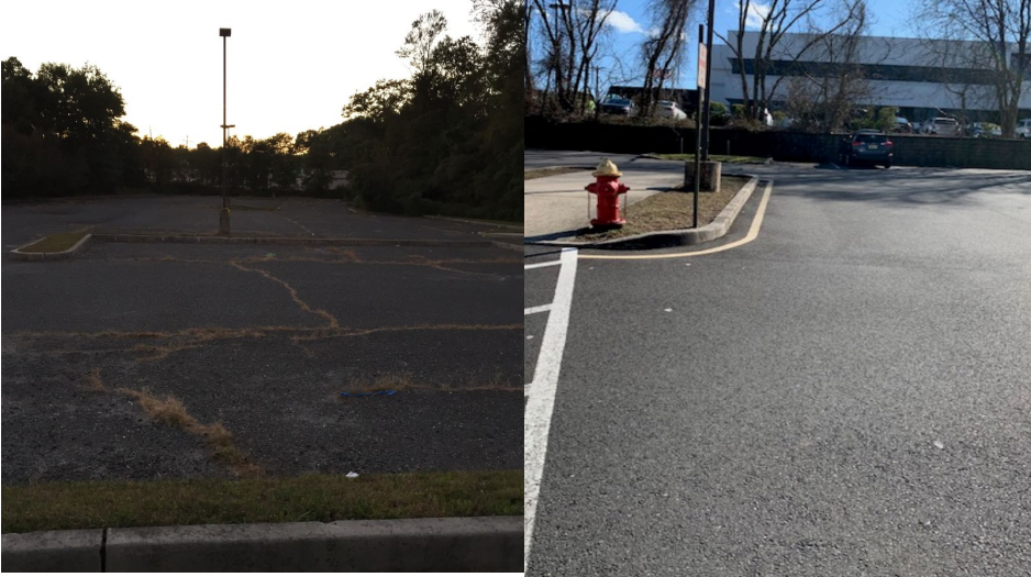
Before and after parking lot at Jersey Shore Ice Arena