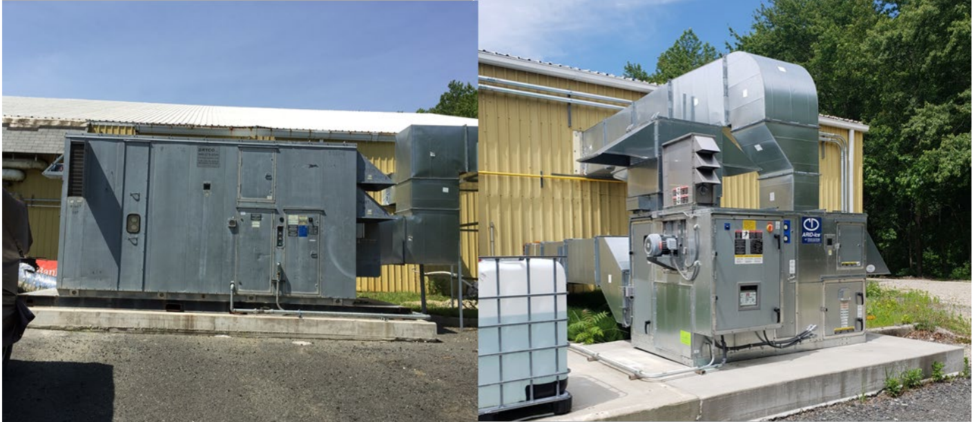
Before and after; new dehumidifier that supports the entire building