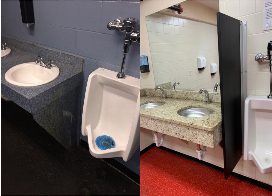
Before and after bathroom flooring, fixture, and mirror upgrades at Jersey Shore Ice Arena.