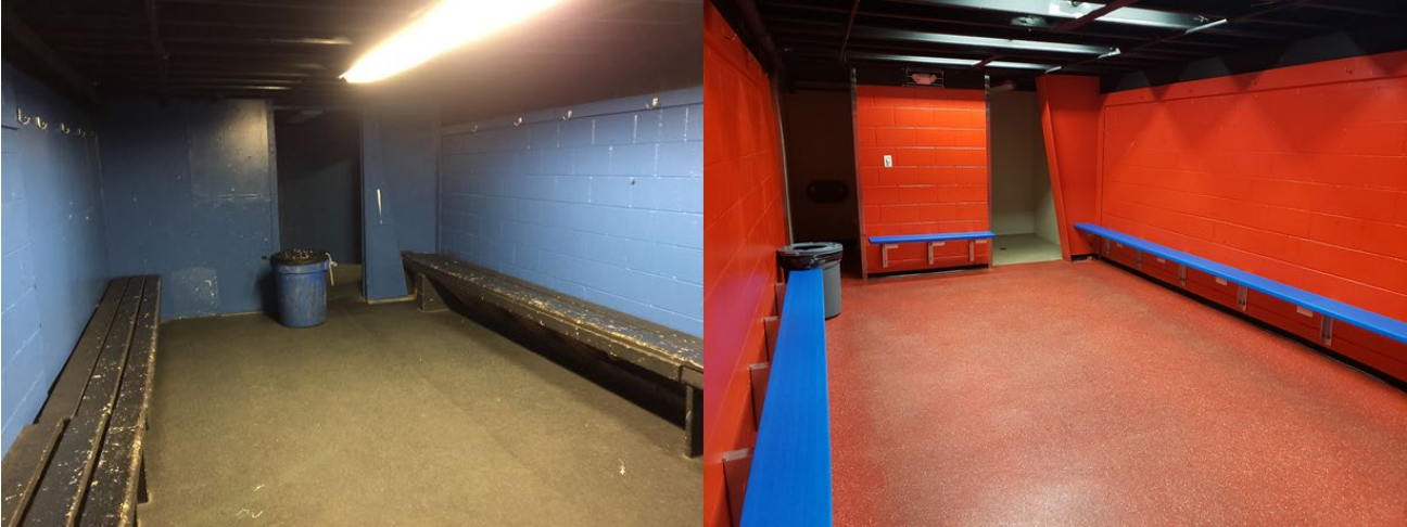
Before and after locker rooms at Jersey Shore Ice Arena