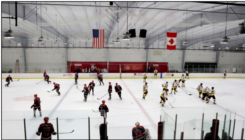
New LED lights and reflective Low-E ceiling installed to improve insulation and lighting

In 2018, Black Bear gained approval from Anne Arundel County to construct a second sheet of ice. Mr. Weiss managed the project and worked closely with both the construction GC and the ice rink installer to deliver the finished project in Summer of 2019. Design commenced in 2017 and the project broke ground in 2018. The second sheet was operational in June 2019.