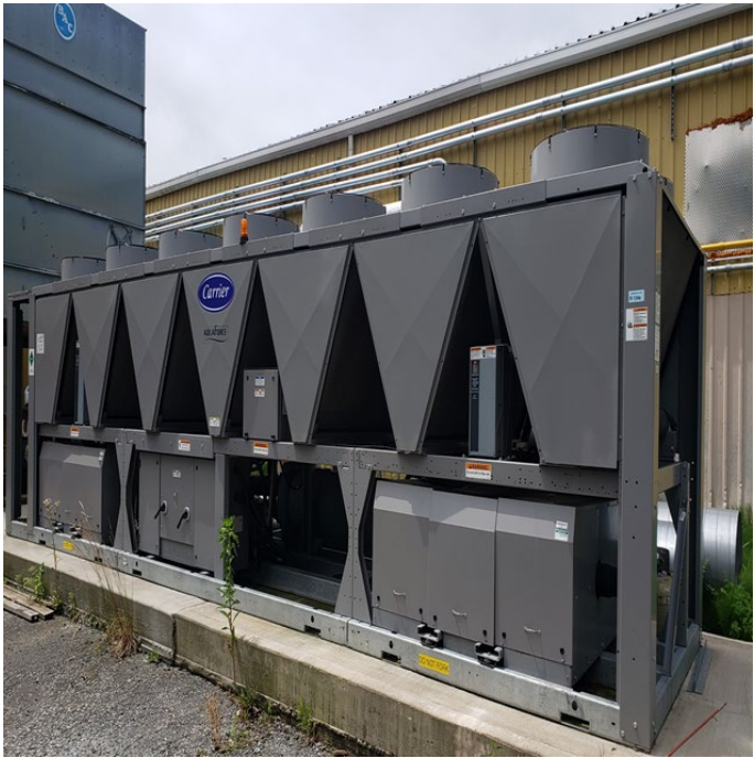
New chillers at Jersey Shore Ice Arena