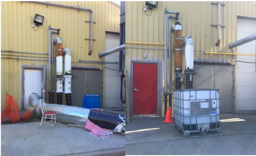
Before and after. Removed non-compliant dehumidifier tubing previously inserted through back door; purchased new dehumidifier (see next page) and installed in proper area.